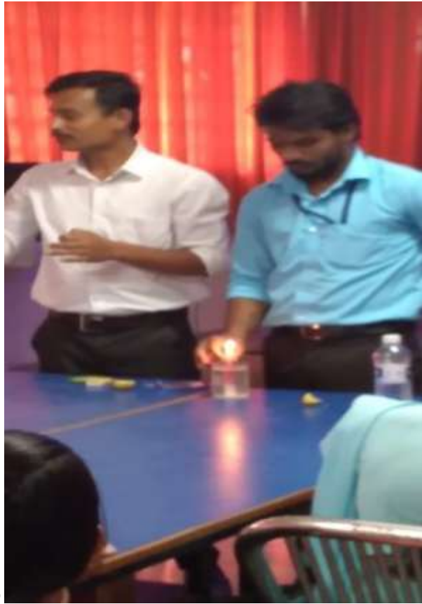
2. Orientation to students going for internship