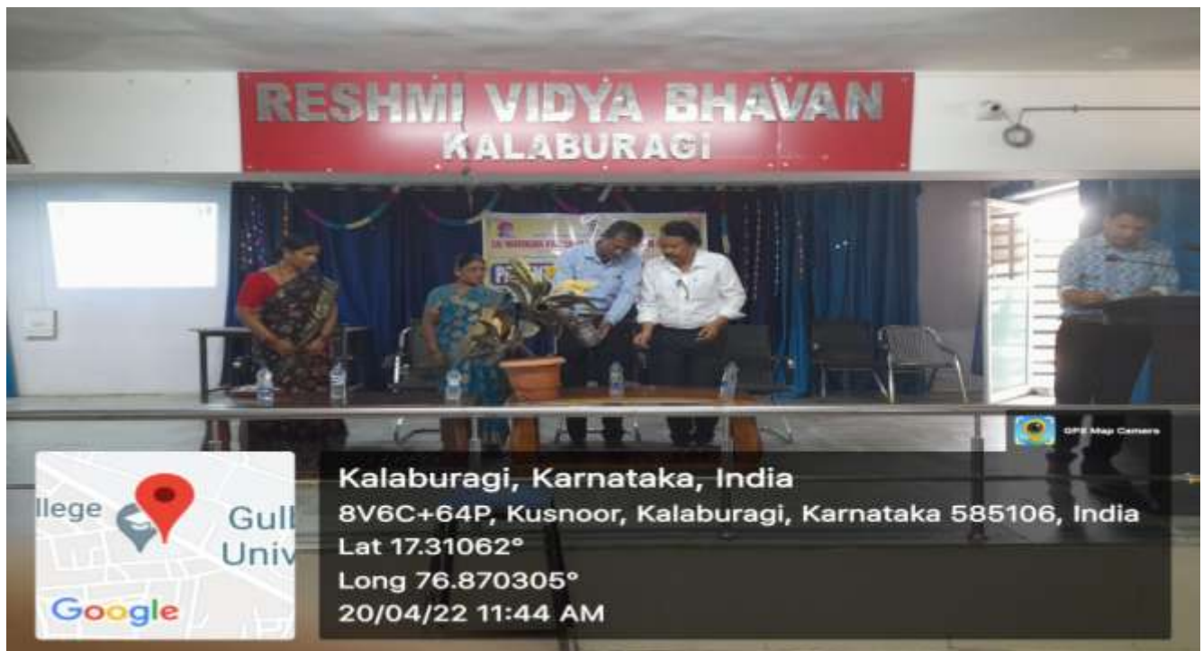
Inaugural of Parent Teacher Meeting

PTA executive body established on 24-04-2022