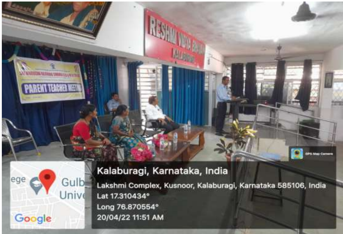
Speak about PTM