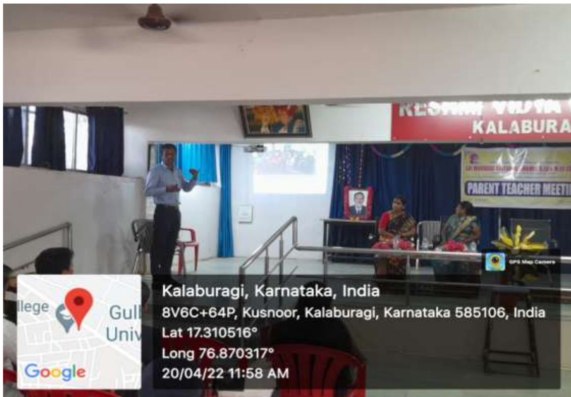
Presented Academic Year Activities