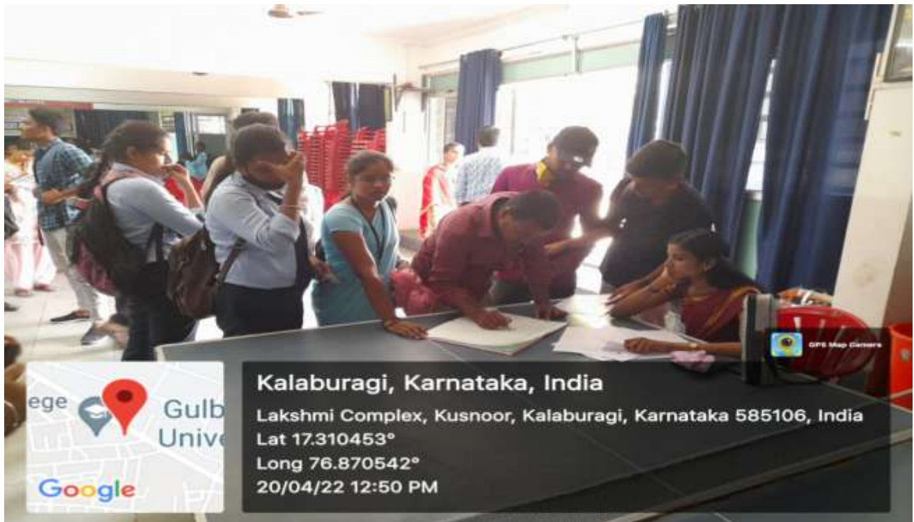
Registration of PTM