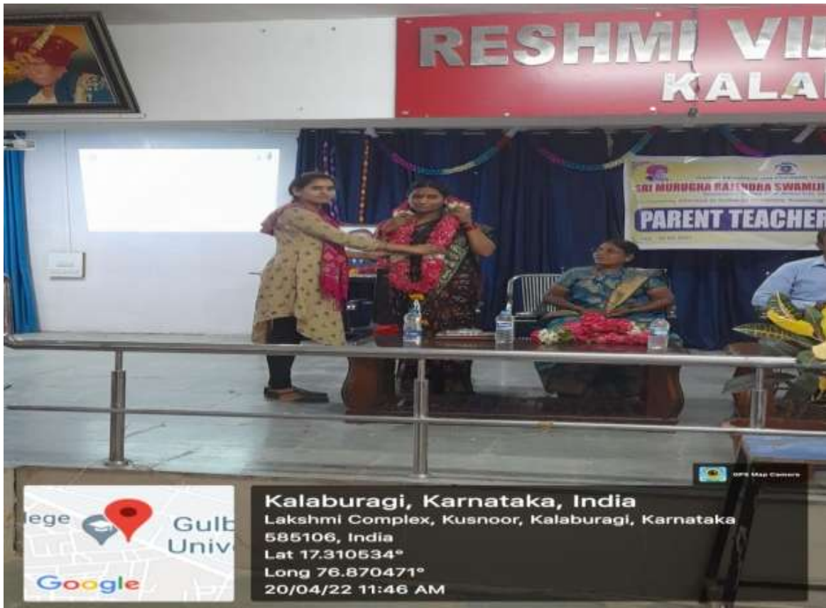
Honoured to Parents