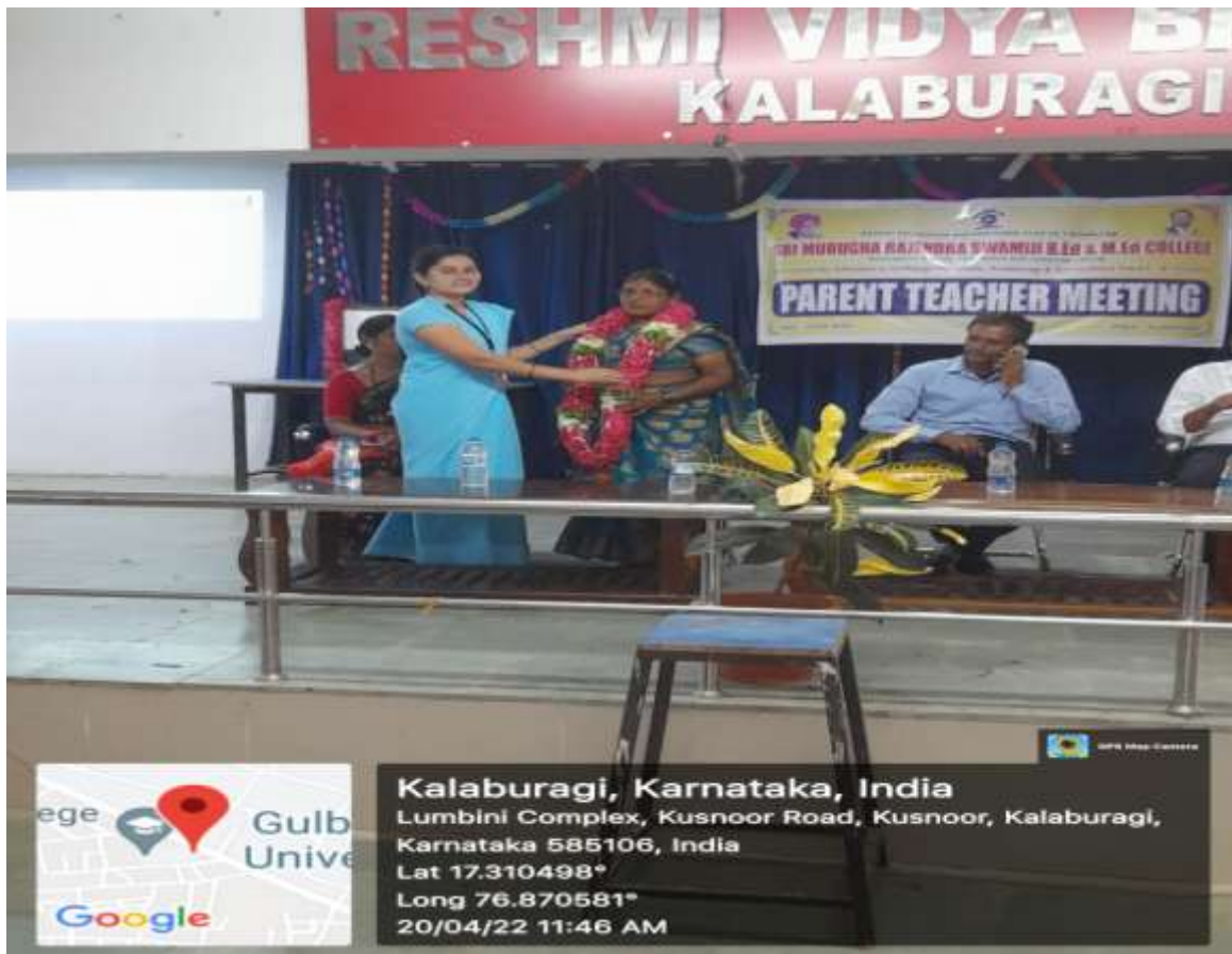
Honoured to Parents