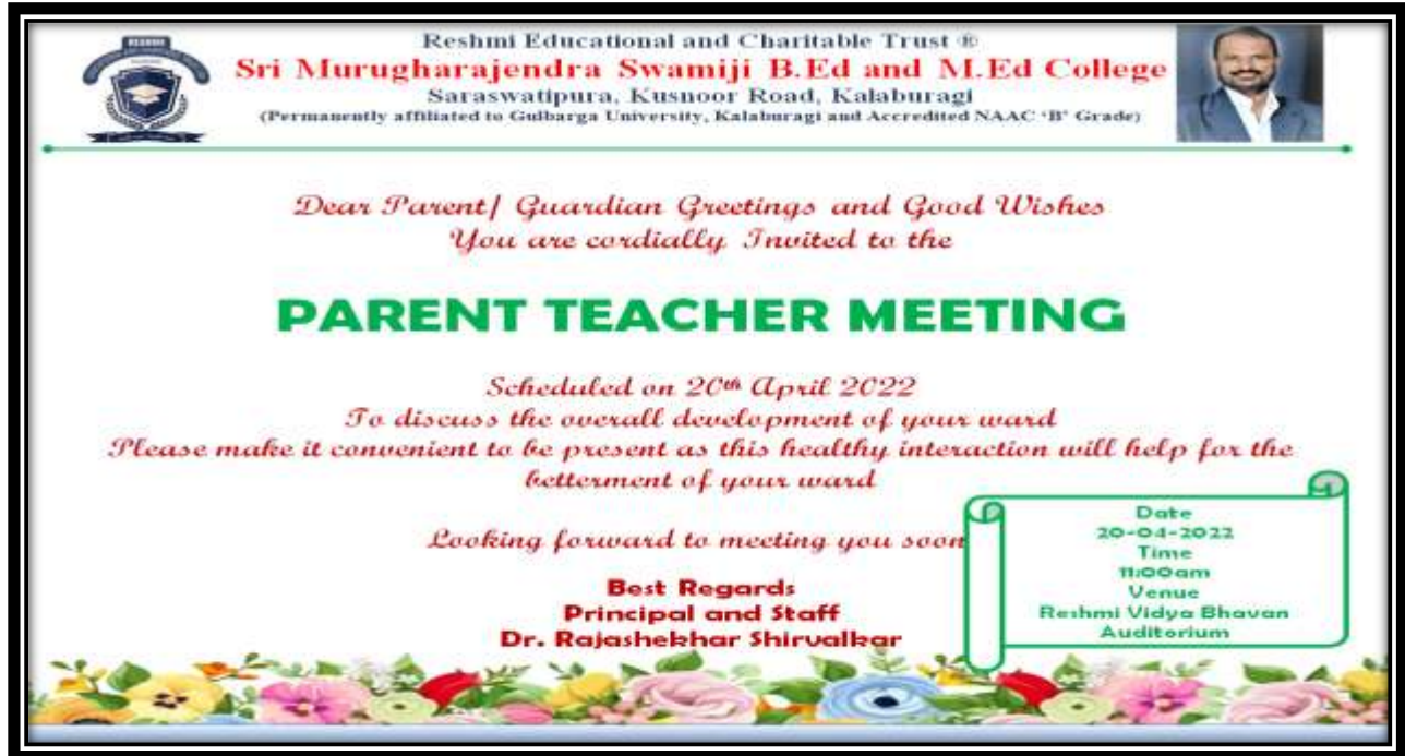
PTM Invitation Letter